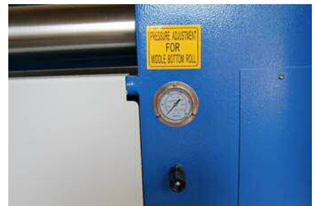
Pinch Roll Pressure Adjustment