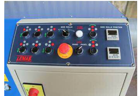
Control Panel featuring Digital Readouts