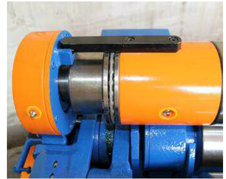
Spherical Roller Bearings

Also Available! 3-Roll Initial Pinch Plate Rolls